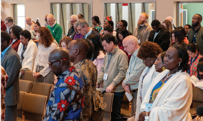
Attendees at the All Nations Celebration held in March.