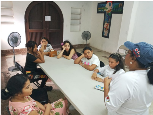
Deaconess & Students teaching VBS in Panama