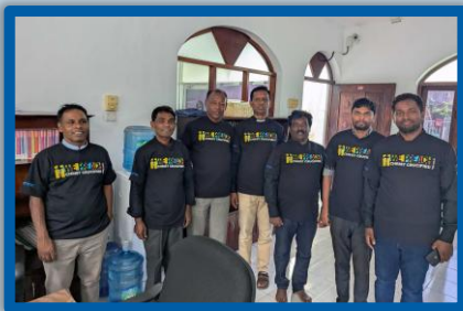
CELC Pastors and Evangelists

We will in the U.S. at the end of July through the end of September. I would love to visit you and your congregation. Contact me a.s.a.p. to schedule a visit. smahlburg@yahoo.com