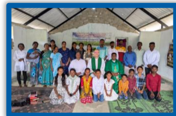
Member of Jerusalem Lutheran Church