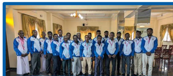
3 rd Annual Diocesan Assembly of the Ceylon Evangelical Lutheran Church