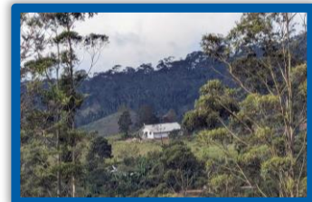
Church in Upcot

The CELC continues its work of disciple making through her four ordained pastors and five evangelists working in fifteen congregations.