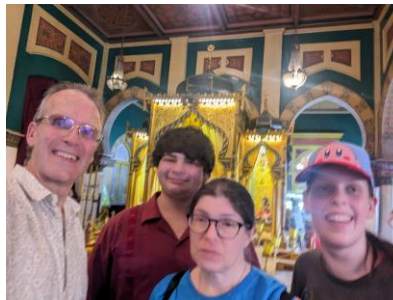
Enjoying the sights in Indonesia

It is also the month when we joyfully welcomed Skye and Rose back for their Christmas break.