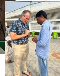
Praying between sessions