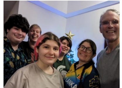
Everyone gathered around the Christmas tree

December is a busy month in any household and ours is no different. In addition to all of the activity surrounding Christmas there is one last birthday of the year, Martha's.