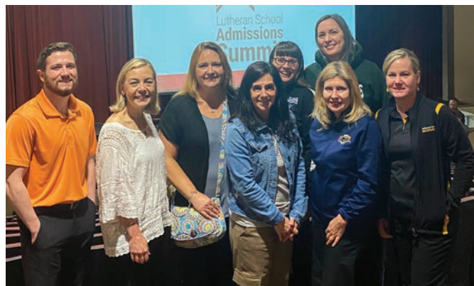
The people in the picture are from Southeast Michigan schools, but there were other Michiganders and attendance too, including Trinity Traverse City, Dearborn, Grand Rapids, Kalamazoo, and Saginaw.