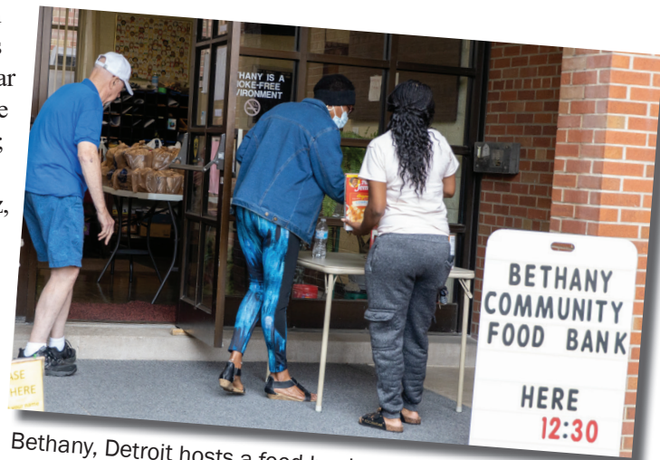
Bethany, Detroit hosts a food bank twice a month.