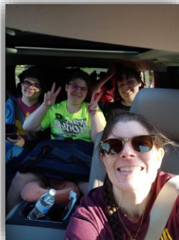
"On the Road Again"