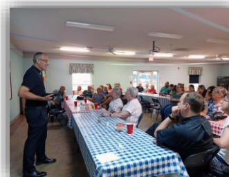
Heavenly Host Lutheran Church, Cookeville, TN

To be added to or removed from this mailing list, send an email message to newsletter@mahlnews.com with the word ADD or REMOVE in the subject line.