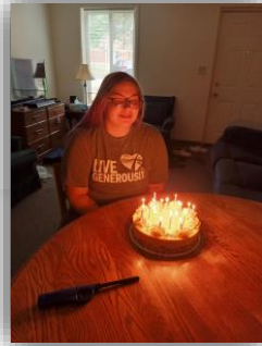
Liberty is no longer a teen!