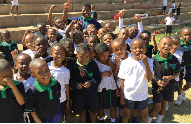
Students at St. Peter's in Middleburg, South Africa, a recipient of International Ministry dollars of the Here We Stand Campaign..

already participated. Thank you! Would you please consider a new gift, or perhaps extending your current pledge another year or two as many have already.