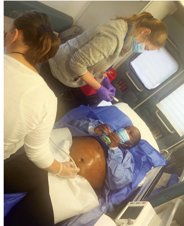
A mom receives pre-natal care through the Luke Project 52 Clinic, an Innovative Missional Ministry of the Michigan District.

Whether you are reading this as an individual or as a representative of a congregation, if you have not yet participated, please prayerfully consider becoming involved soon. If you have