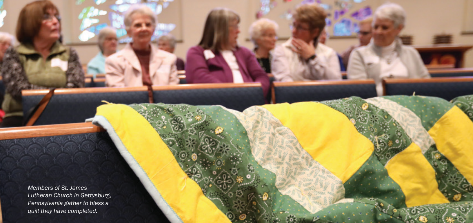
Members of St. James Lutheran Church in Gettysburg, Pennsylvania gather to bless a quilt they have completed.