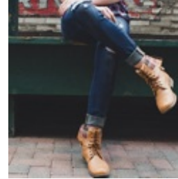
Legacy--Reclaiming a Lost Generation