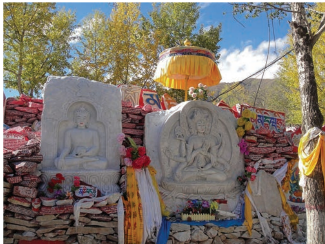
Mani stones represent prayers offered by the Buddhist faithful. The Yushu Jiana Mani stone mound, located in Xinzhai village of Yushu Tibetan autonomous prefecture, is estimated to have over 200 million stones.

How blessed we are to have a direct line and to know that God is listening. He tells us clearly: “Call upon me in