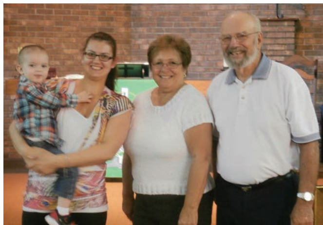
New Members at Faith, Prescott