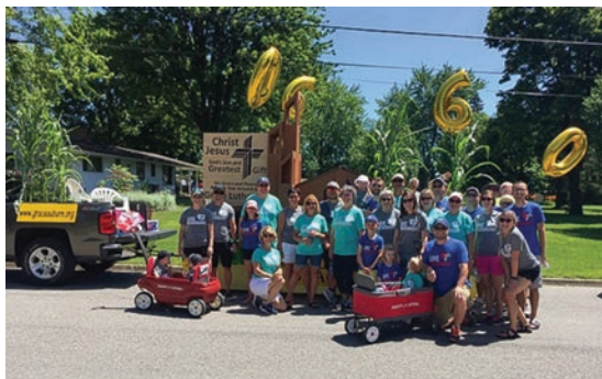
Members of Grace, Auburn joined the Cornfest parade this past summer