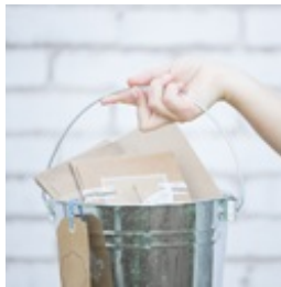
Submit your story here.