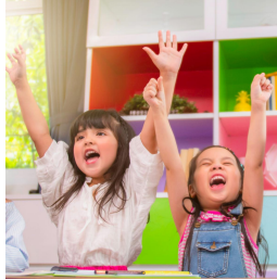
Our Savior, Lansing Receives 5-Star Quality Rating