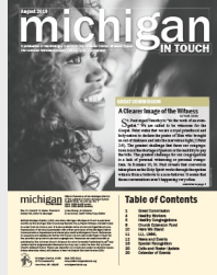
August 2019 Michigan In Touch Supplement