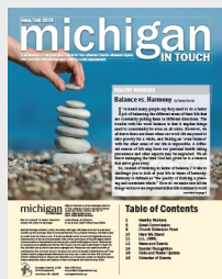
June/July 2019 Michigan In Touch Supplement