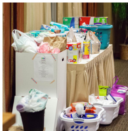
Conference Attendees' Great Compassion Recognized