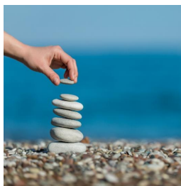
Balance vs Harmony by Travis Grulke