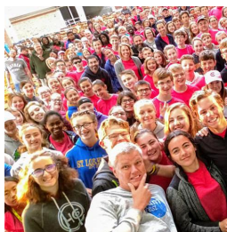
Jr. High Gathering Recap