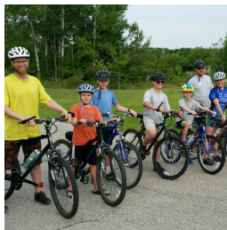
Here We Ride for Here We Stand