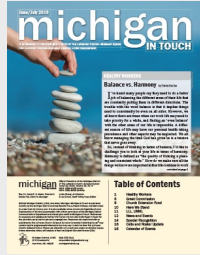
June/July 2019 Michigan In Touch Supplement