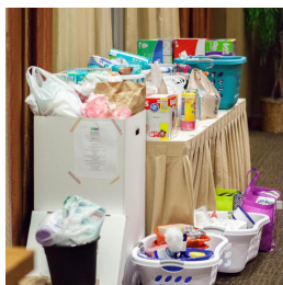
Conference Attendees' Great Compassion Recognized