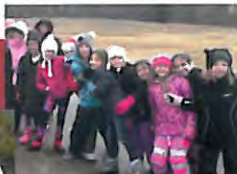
Meet our Staff