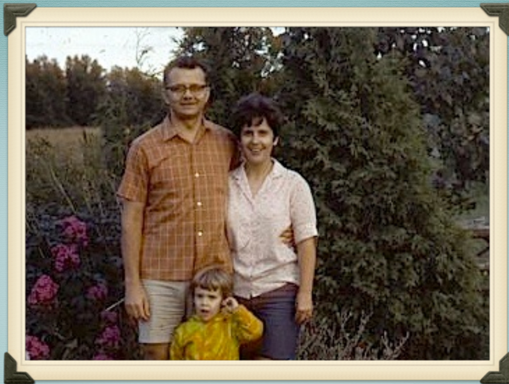
My Family Growing Up | Dad, Mom, Me